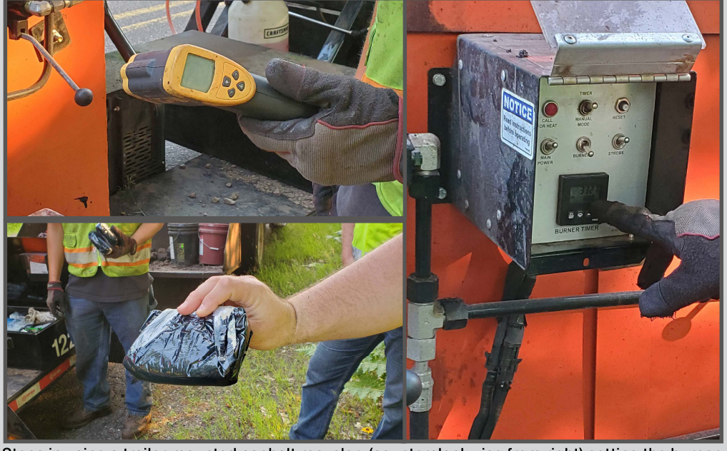
Steps in using a trailer-mounted asphalt recycler: (counterclockwise from right) setting the burner timer, checking the temperature of the mix with a gun, adding rejuvenator pucks.

Making hot-mix asphalt using stored virgin asphalt or recycled millings is possible with a trailer-mounted asphalt recycler. The KM T-2 model, which the City of Traverse City purchased can make 1.3 tons of recycled asphalt in approximately 30 minutes or a little longer if moisture from snow or water needs to be dried out of the asphalt; once dried, the process can go quickly. The Stepp SMMT model, which KCRC recently acquired, can produce up to a quarter ton in about 8 to 15 minutes. While a Minnesota report suggests that similar models of the