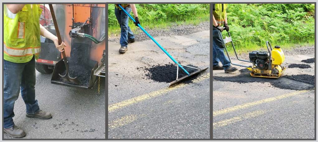
Freshly-made recycled asphalt being dispensed from a trailer-mounted asphalt recycler (left), raked into a pothole (center), and compacted with a plate compactor (right).

In the Ohio study, cold patch had poor adherence to the pavement itself.<sup>2</sup> Performance improved with the addition of a tack coat. The study identified two factors contributing to its shorter life: density and compaction techniques. Those two factors can be improved by compacting from the center outward and leaving a crown on the patch for subsequent compaction via traffic load.<sup>2</sup> However, the study noted that the temperature difference between the patch and the existing pavement is the "main