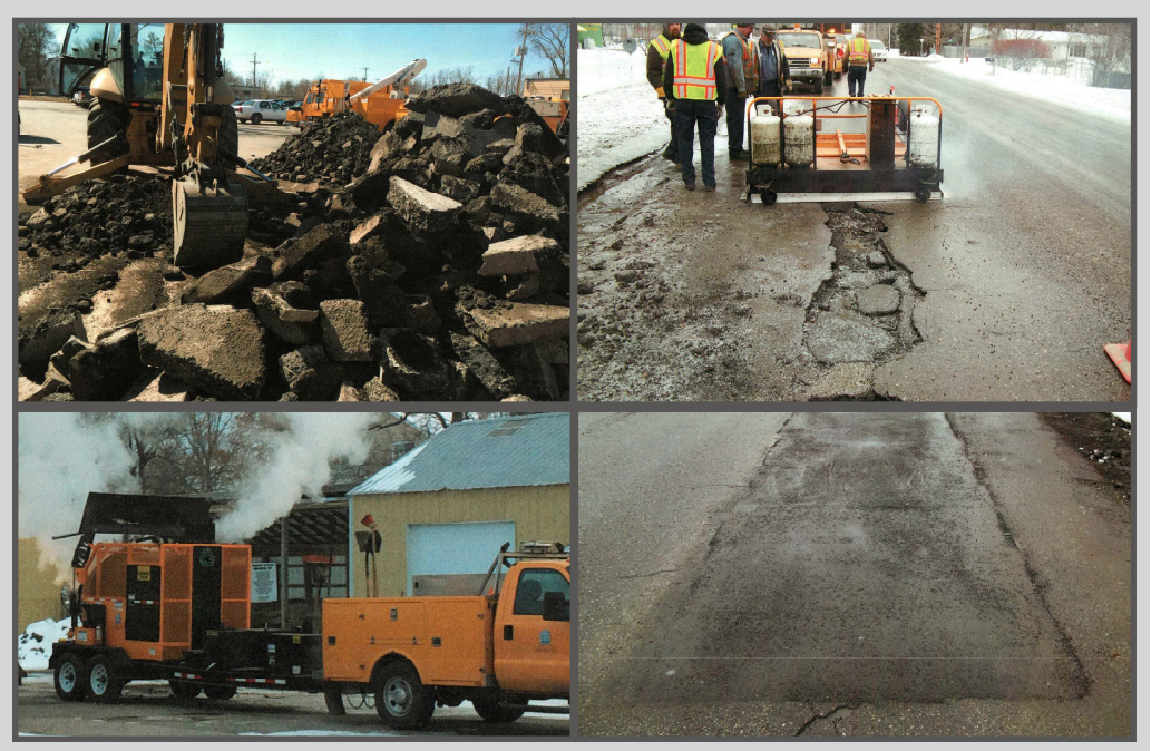
Millings from road project for recycling (top left) and asphalt recycler in operation (bottom left); Pavement in Traverse City prior to (top right) and after infrared patching (bottom right).

Being able to create a hot-mix asphalt on site can also extend the paving season. Stepp equipment was found to produce successful batches of hot-mix asphalt for patching in temperatures as low as 20 degrees Fahrenheit<sup>4</sup> although the manufacturer suggests it can be used at a broader range of ambient temperatures. Both the City of Traverse City and KCRC stockpile their millings. Jones says they use these stockpiled millings or hot-mix purchased late in the season to "get through winter and spring" pothole patching. He also notes that they use their infrared machine throughout the winter although it has been reported that heating the asphalt to the necessary 275 to 300 degrees Fahrenheit can take ten minutes or longer.<sup>4</sup> Nonetheless, Jones says the infrared machine and asphalt recycler enable them to repair problem areas quickly, "especially if we start seeing blowing tires in potholes", throughout the winter and early spring seasons.