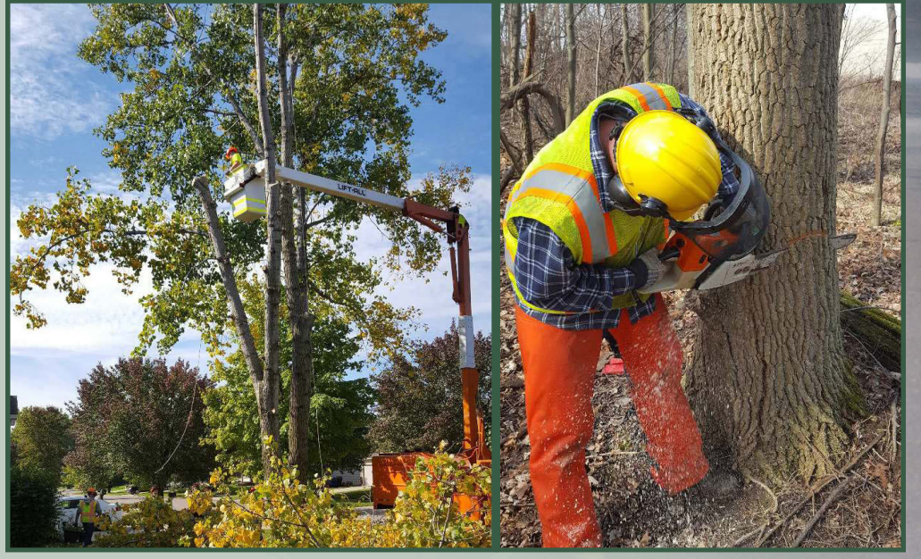
Left: Tree cutting operation using ropes to guide the fall; right: notching a tree using a chainsaw

Chainsaw safety and cutting technique classes are offered through Bay College Training and Development (Michigan Technical Education Center, or M-TEC) in Escanaba (see https://www.baycollege.edu/ on-campus/workforce-training/index.php). For those who intend to use aerial lift for