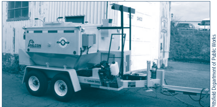
City of Pittsfield's asphalt reclaiming hot box.

So far, the City of Pittsfield DPW has only made the cookies using new asphalt intended for that purpose, but the process would also work well with asphalt left over after a paving job. - 1