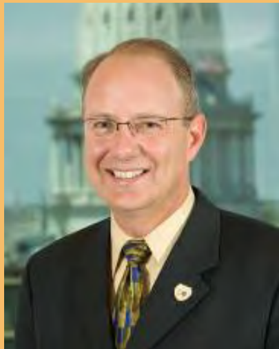
Kirk Steudle MDOT